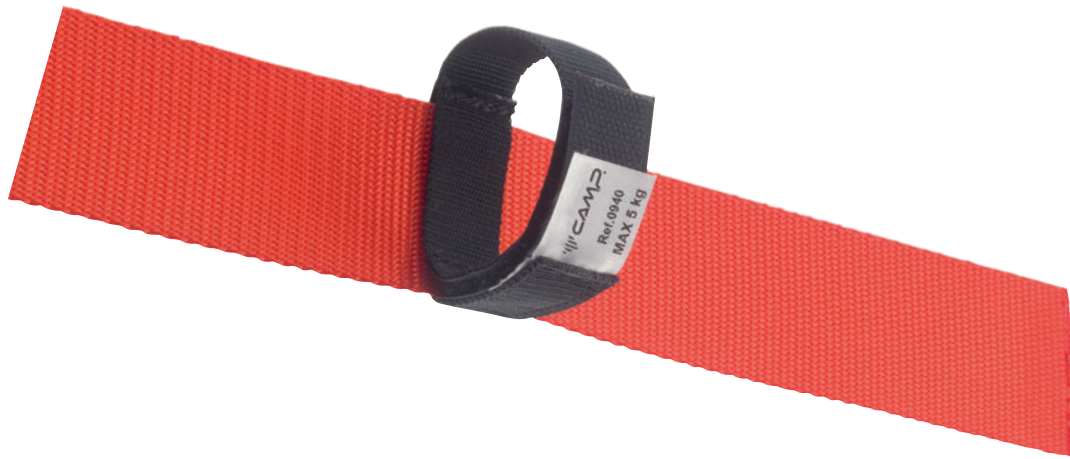
Installation on the harness